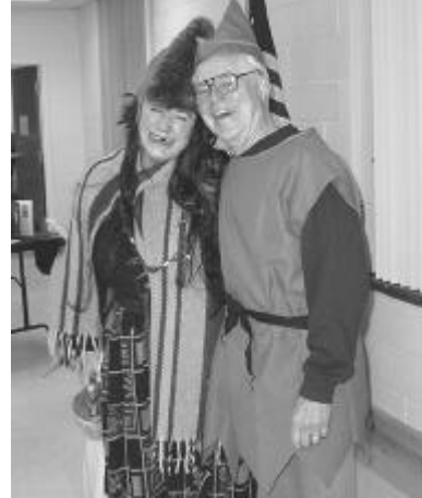
Our very own troll and leprechaun made a surprise visit .