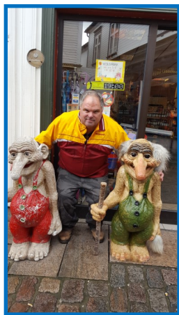
Left: Posing with two trolls outside a store in Stavanger. Right: Three Swords Monument in Stavanger