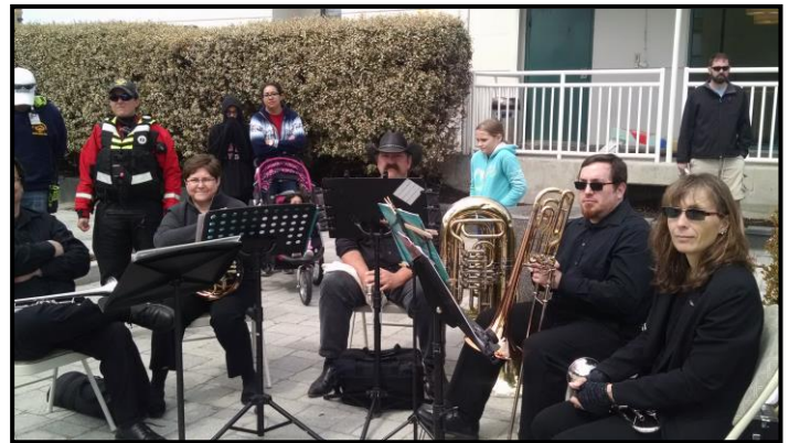
Above: Members of the Symphonic Artistry Wind Ensemble provide music at the ceremony. Left and Below: Ceremony Attendees (a good turnout)