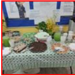
Every good meeting involves good food.